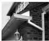
Fascias, Soffits and Guttering