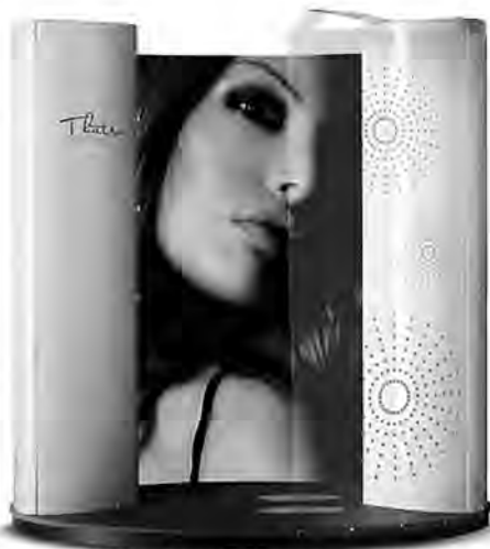
AUTOMATED SPRAY BOOTH

Fully automated booth uses exclusive patented Microcore technology giving incredible, complete and even coverage to deliver the ultimate self tan