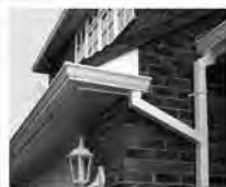
Fascias, Soffits and Guttering