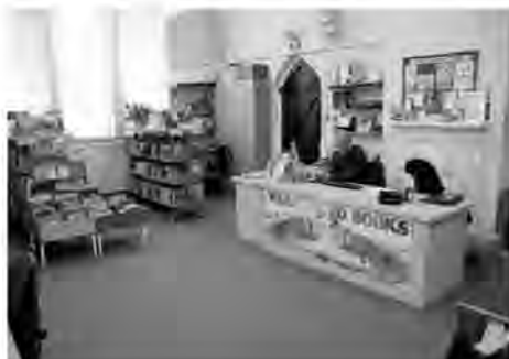
View of Library

The library has a constantly changing stock of about 5000 books. This number is split approximately 50:50 between adult and children's books. The library has many non-fiction children's books that cover the present school curriculum. Why not come along and have a look at our selection. If we haven't got the book you need we will do our best to get it in for you providing the cost is not too high. In addition we have a very wide range of children's books to suit all ages. So why not bring your children to visit your local library?