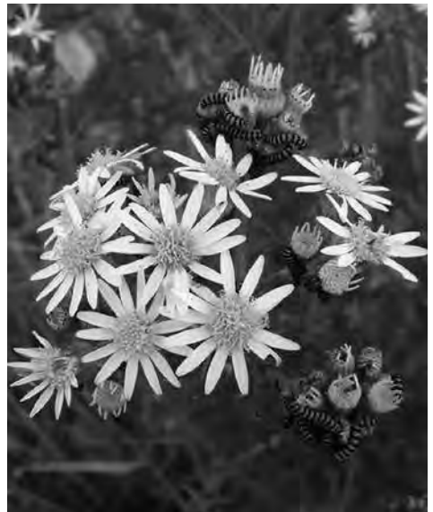
Ragwort with Cinnabar moth caterpillars by Trish Steel