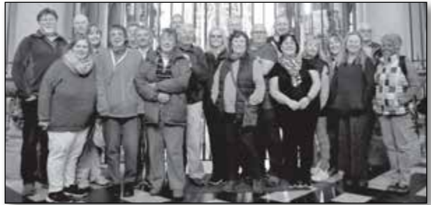
The Cologne group in one of the historic churches rebuilt after WWII

At the end of September a group of 22 members travelled to Cologne via Eurostar for a long weekend exploring the city and sampling some of the locally brewed Kölsch beer in the many brauereien in the old city. However, it wasn't all eating and drinking, with visits to the magnificent cathedral (Dom), the museums and churches, and a river cruise on the Rhine.